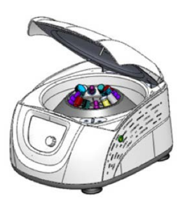
2) Remove foam pads at the hinge latch and from around the rotor.

1) Open the lid: Use the included Door Key to press the button on the right side of the unit.